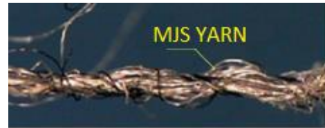
VORTEX MJS YARN