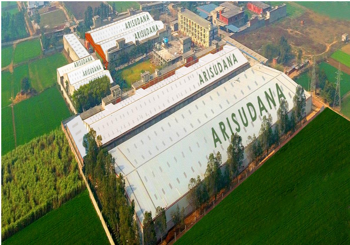
AERIAL VIEW OF OUR SPINNING UNIT IN LUDHIANA

Vortex Spun Yarns : Raw White & Fancy Ring Spun Yarns : Raw White & Fancy