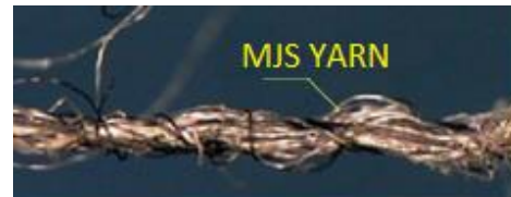
VORTEX MJS YARN