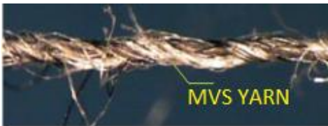
VORTEX MVS YARN